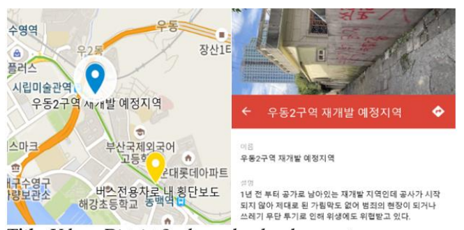
Title: Udong District 2, planned redevelopment area Narrative: It is a redevelopment area that has remained empty since a year ago, but construction has not begun; thus, there is no proper screen, making it a crime scene or threatening hygiene due to unauthorized dumping of garbage.

Figure 9. Dangerous built environment-Redevelopment area with empty houses (Region near Busan International Foreign Language High School in U-dong, Haeundae-gu, Busan)