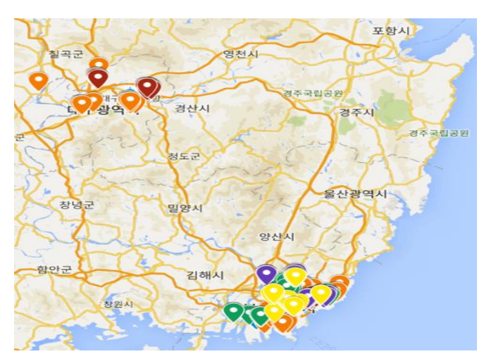
Figure 2. Map showing the results of community mapping

tool in secondary geographical classrooms, which can increase students' knowledge and understanding of the local community and encourage them to actively participate in solving problems.