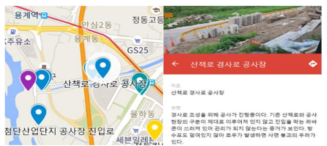
Title: Construction area of the slope of the walkway

Regarding the first question, the results revealed that first, the teachers said that community mapping activities could allow students to acquire location knowledge as the basis of geographic literacy (Cook & Quigley, 2013). In addition, it was suggested that students can develop spatial thinking skills through the process of displaying information on a map, checking the location, or viewing a map and imagining topography or landscape. When community mapping using geographical information technology is applied to inquiry and problem-based geography education, the spatial thinking skills of students can be improved. When community mapping is employed in schools, students can effectively and intuitively investigate, compare, analyze, and share geographical data. Through this, students will be able to discover local problems and find solutions to them, and their interest and understanding of the region will deepen (Kerski et al., 2013). Second, teachers disclosed that the two participatory research methods can be utilized for performance evaluation or outdoor survey activities that can be conducted during club activities. Third, community mapping and photovoice activities can